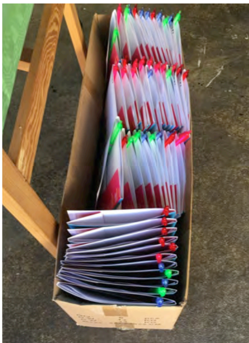
The Manifesto and all the informations for the TMR Festival