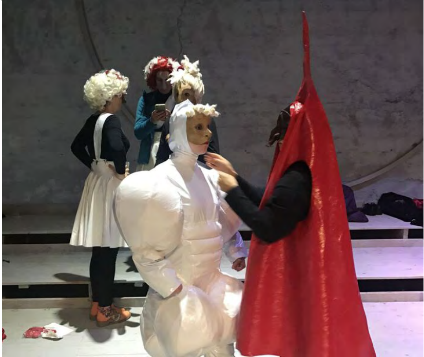
Late night rehearsals in the big theater