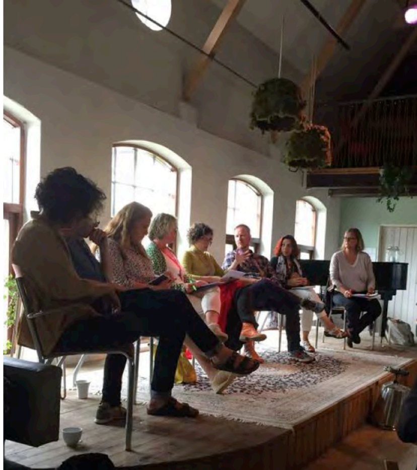
Panel from 2 nd day: Seminar II