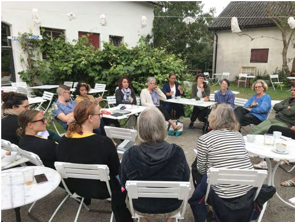
Seminar II - Group 3: Artistic tables

One recurring conclusion was that there is a need for everyone in power (whether temporary or for a longer term) to be aware of one’s own responsibility. Whether we are of a certain gender, ethnicity, religion, ability or socioculturally privileged part of the world we will always have moments with access to more or less power. There is a need for love, conscience and compassion with the Other, and an awareness of power as a result of continuous inner and outer dialogue and negotiation.