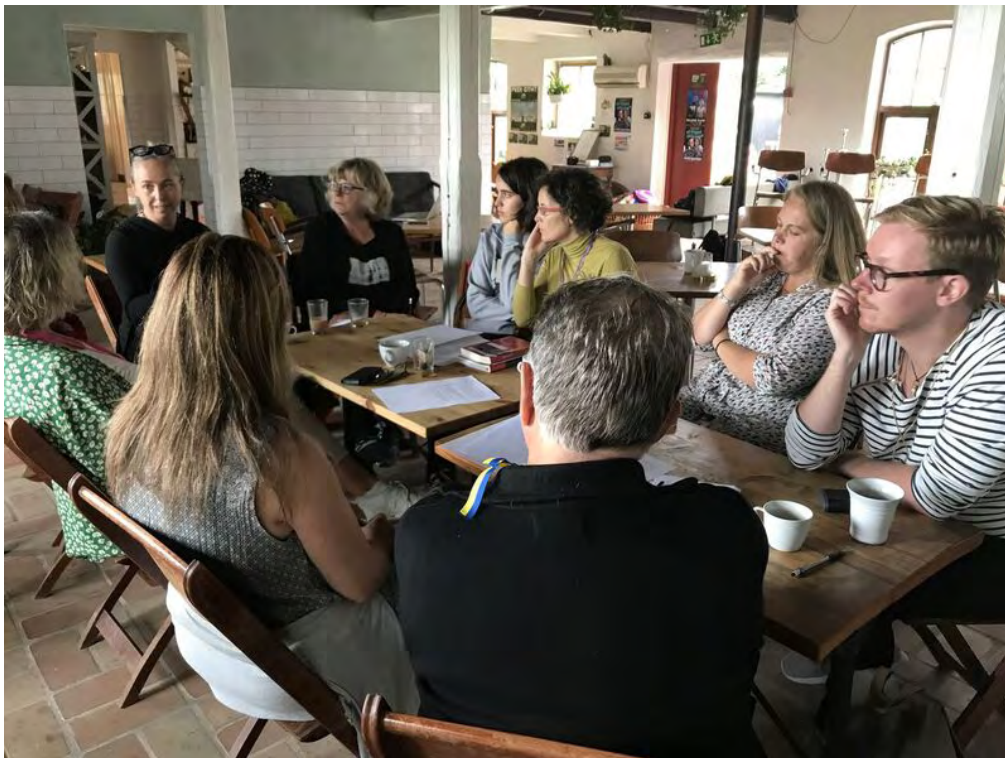
Seminar II - Group 1: Institution table

There was a general discussion about this festival – and the theatre in general – being a potential "Trans Zone", where different ideas and multiple identities could and should be explored and negotiated on equal terms. Distinctions were made between archetypes – that we all carry within – and stereotypes, which are images formed within specific cultural contexts.